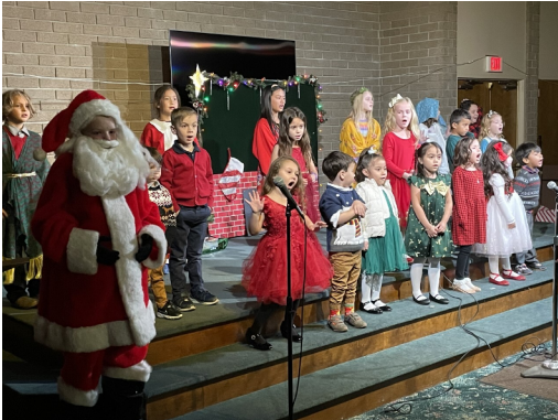
Whittier Friends School students sing "Jingle Bell Rock" with their families and friends at their first Christmas performance since December 2019.

All was not calm, but all was definitely bright, this holiday season at Whittier Friends School! With great joy and 100% attendance by our student body, Whittier Friends School hosted their first in-person Holiday Performance since December 2019. Ten preschoolers sang and danced to "Santa Shark," a holiday version of the infamous preschooler favorite, "Baby Shark." Nine primary elementary students performed a pantomime to the classic "Twas the Night Before Christmas" complete with