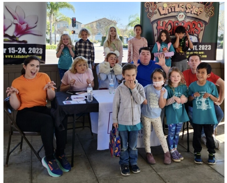
Whittier Friends School students visit the actors of "Stuart Little" after the performance at La Habra Depot Theatre.

Hear ye, hear ye! Tuesday, March 21 at 6:00 pm, you are cordially invited to visit Whittier Friends School's Open House and Science/History Fair! On display, visitors will find castle models from throughout the world and throughout the ages, and research projects about space. They'll get a chance to see what our multi-age elementary and preschool classrooms look like. They'll even get to visit our class pets, Remi the rat and Creeper the snake.