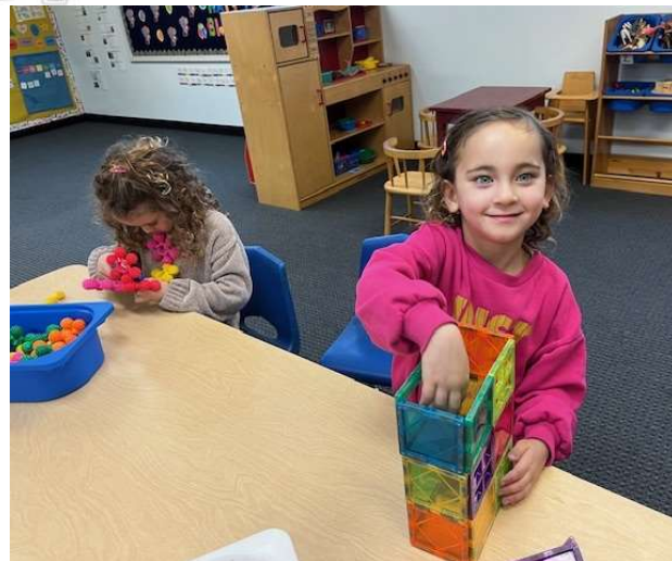
Preschool friends at Whittier Friends School making "rainbows" with colored toys one rainy day.

"Heads, Shoulders, Knees, and Toes"... and also all those parts inside your body too! On Tuesday, March 19, at 6:30 pm, you are cordially invited to visit Whittier Friends School's Open House and Science/History Fair! On display, visitors will see elementary-age research reports about parts of the body, and an inquiry/observation project made by our preschool children. Visitors will also get a chance to see the entries for the Los Angeles County history competition, History Day LA , made by the upper elementary students.