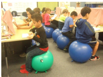
These are gym ball chairs.

So bring your small bills to Meeting for Worship every Sunday to help the students at Ramallah Friends School.