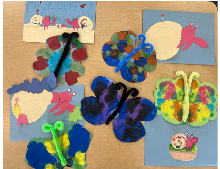
Art inspired by Eric Carle from WFS Summer Enrichment

Whittier Friends School, continued from page 3