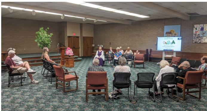
Summer Worship on Zoom in Fellowship Hall

Celebrating Friends today: We are still here, we are strong, and we are a beautiful community of people who love each other and welcome new folks. The new gifts that you bring continue to carry our legacy forward. We have evolved in having an online component, the mission collaborative, and Peace Day. We are growing spiritually, emotionally, and loving each other. We are growing in understanding the Quaker traditions. We are faithful to their legacy and are carrying it forward in new ways and facing new challenges with hope.