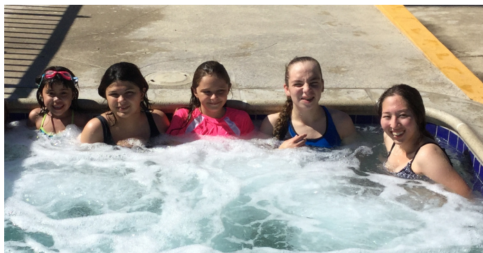
Enjoying time with friends—just one highlight of the

Mail your check to the church or drop it off in the church office. Please put Quaker Life in the memo field.