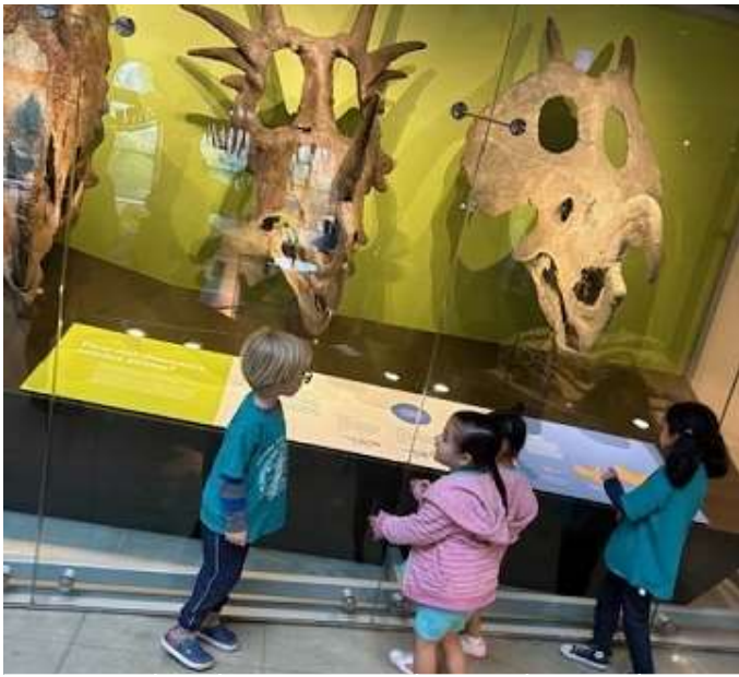
Preschool and kindergarten friends admire various triceratops skulls at the Natural History Museum

in attendance, and they marveled at the size of the bones on exhibit. You can learn about things in a book, but sometimes you just don't fully understand the magnitude until you see it in person. We are so fortunate to live near this incredible museum.